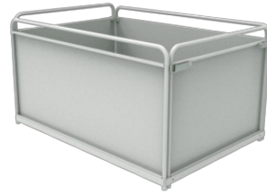
Platform 885x1250xh620 mm