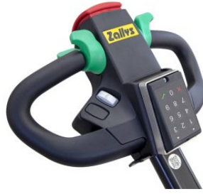
Key Pad on/off