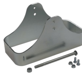
Guard for direction wheel