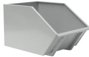
Painted skip 500 L