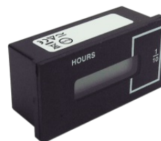
Digital hour meter