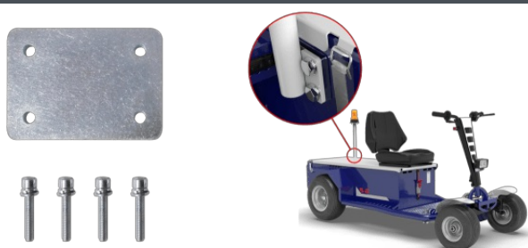
Spacer kit for flashing beacon