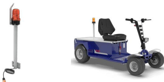
Pole mounted flashing beacon