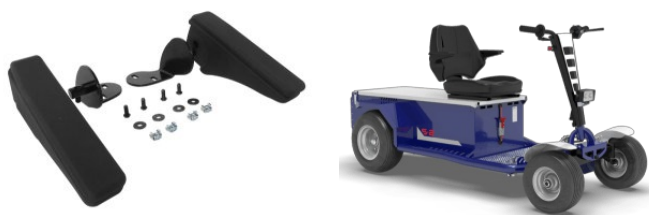
Pair of pivoting armrest