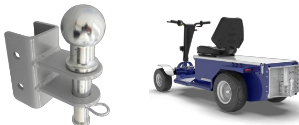
Ball/pin hitch Ø20-25