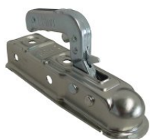
Coupling ball for trailers