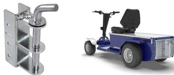
Drop pin hitch Ø20 mm