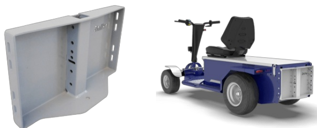
Mounting plate for hitches