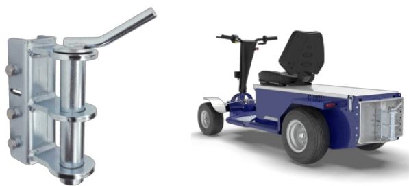
Drop pin hitch Ø35 mm