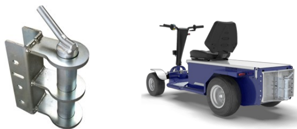
Drop pin hitch Ø40 mm