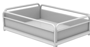
Platform 750x1020xh230 mm