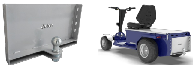
Towball trailer hitch