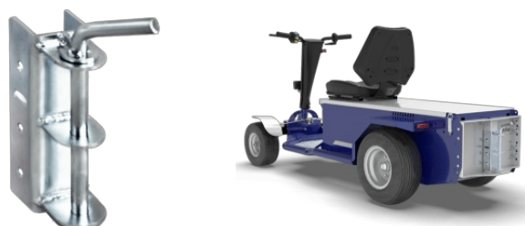
Drop pin hitch Ø16 mm